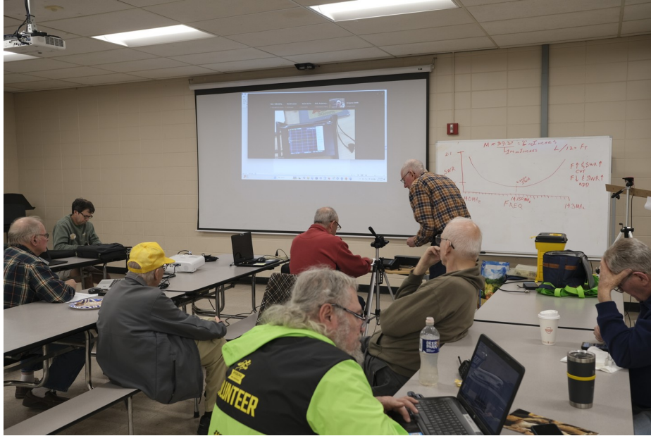
NanoVNA Training by WB2ZDH and KE2KE