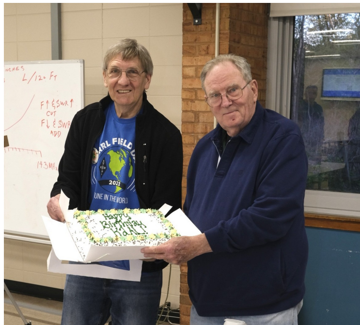
KC2OSR presents birthday cake to K2AL