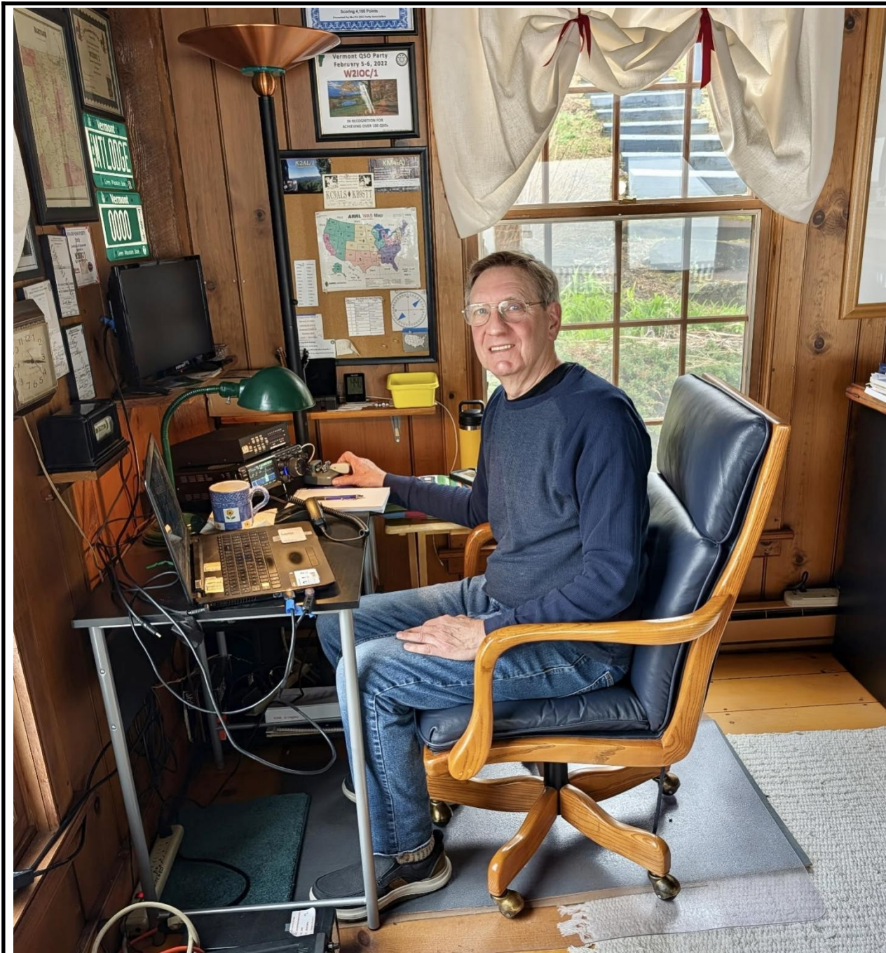
Operating K2AL/1 with my Yaesu FT-710 and LDG AT-200Pro Tuner