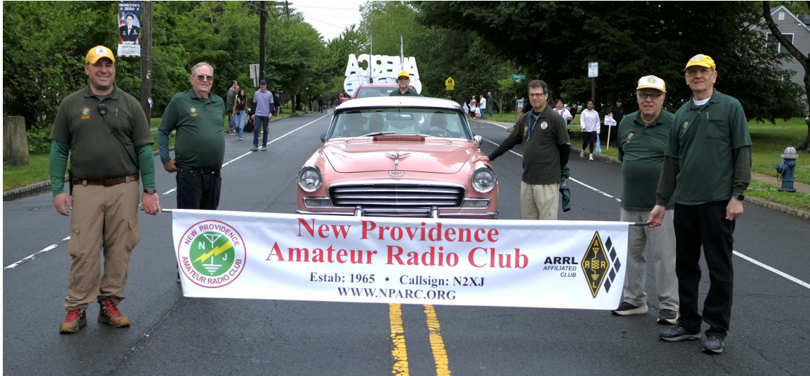
Parade Participants with Classic Car following !