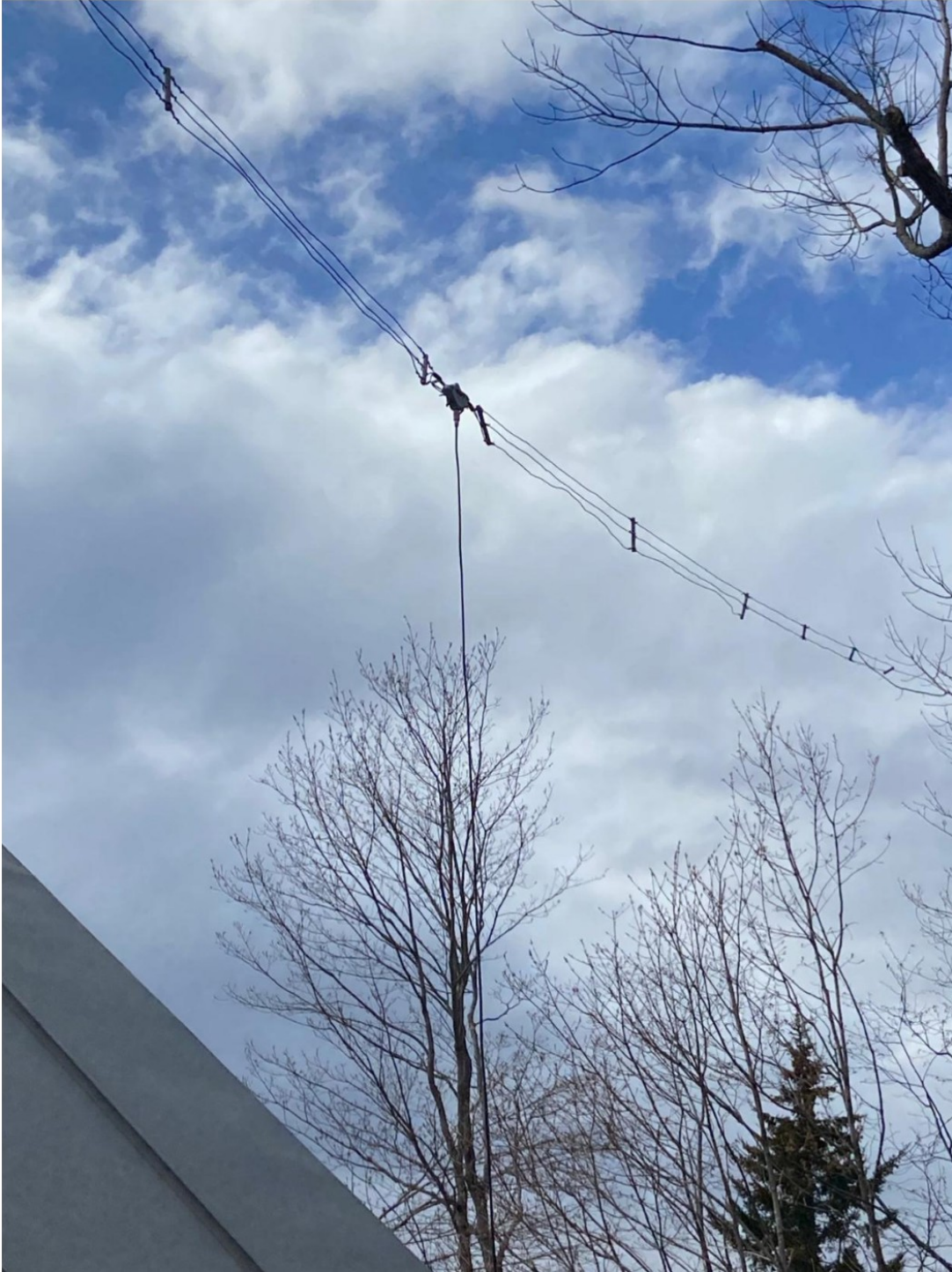
The W2IOC Fan Dipole for 80-10 Meters