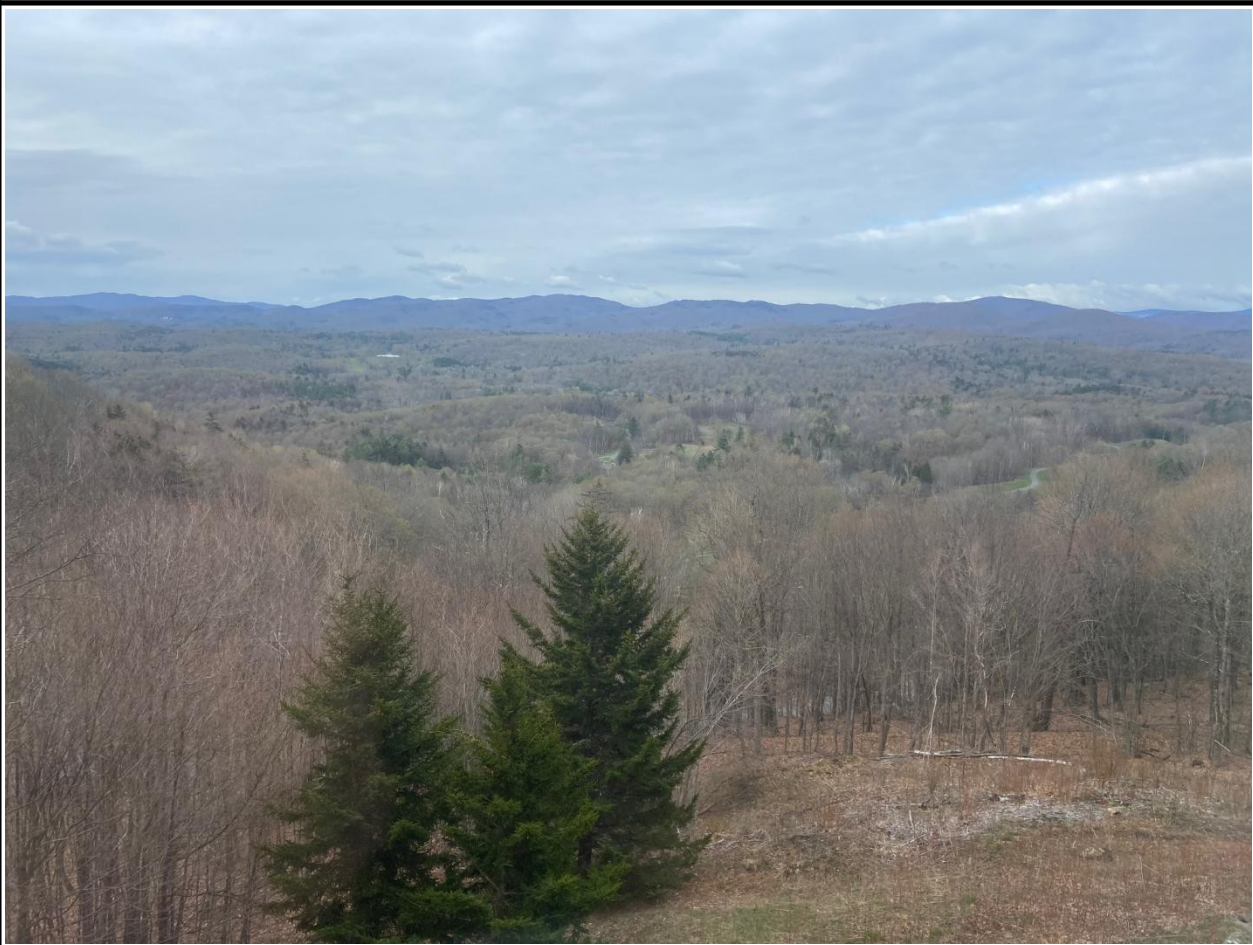
View of the Green Mountains and Killington from the shack