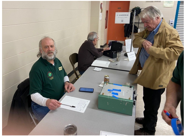
The cashier's table where KC2WUF and K2YG collect the Benjamins.